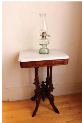
Knapp side table