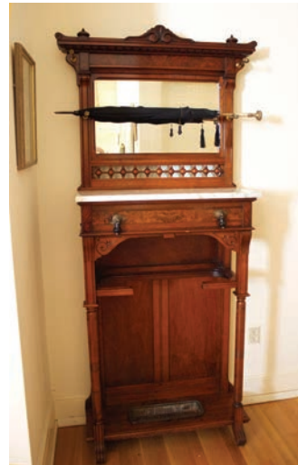
McFarland Umbrella stand