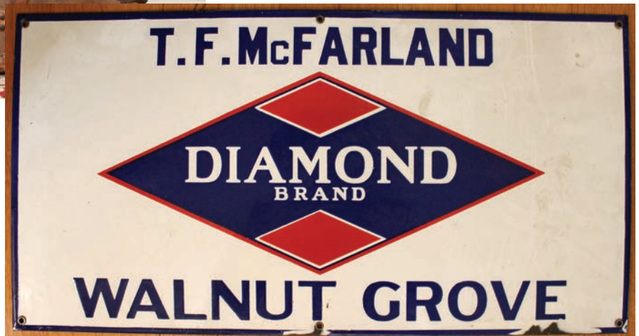
Metal Walnut Grove sign found in Mcfarland trunk