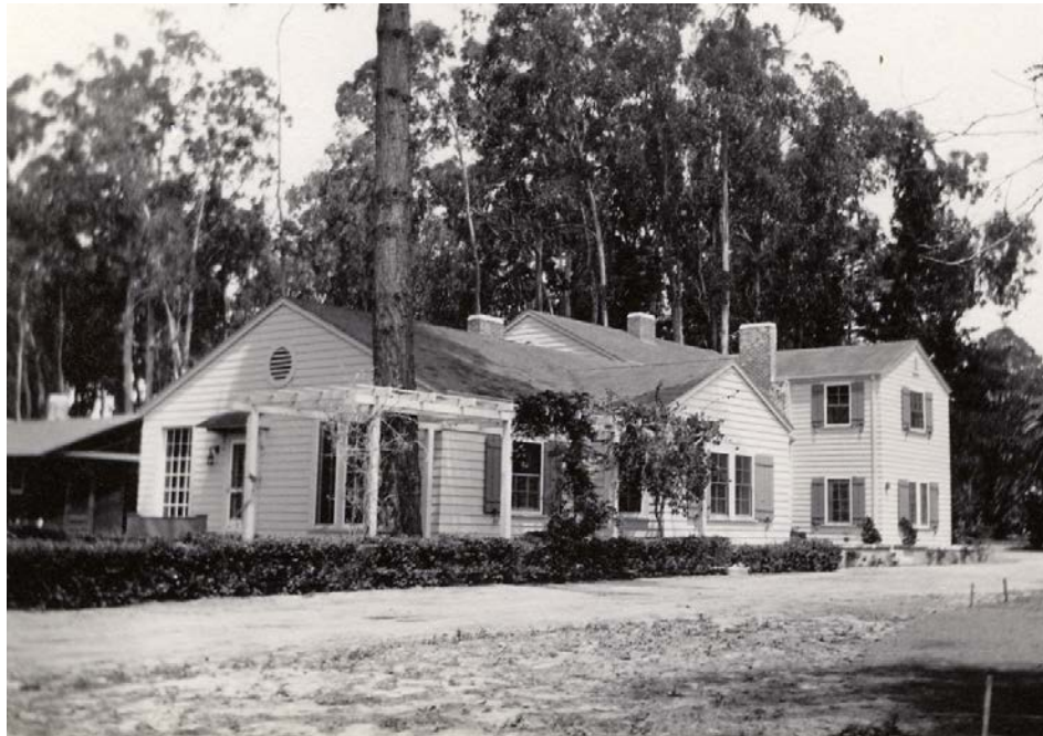
The Richard Bard Home, Hueneme, Ventura County Landmark 88

Between 1865-1870, Thomas Bard travelled often to Hueneme by horse from his home on Sulphur Mountain in lower Ojai. In 1870, he moved to Hueneme in order to build the wharf, and presumably built a temporary structure to live in while his first home was built in 1876 on the site of the Bard mansion.