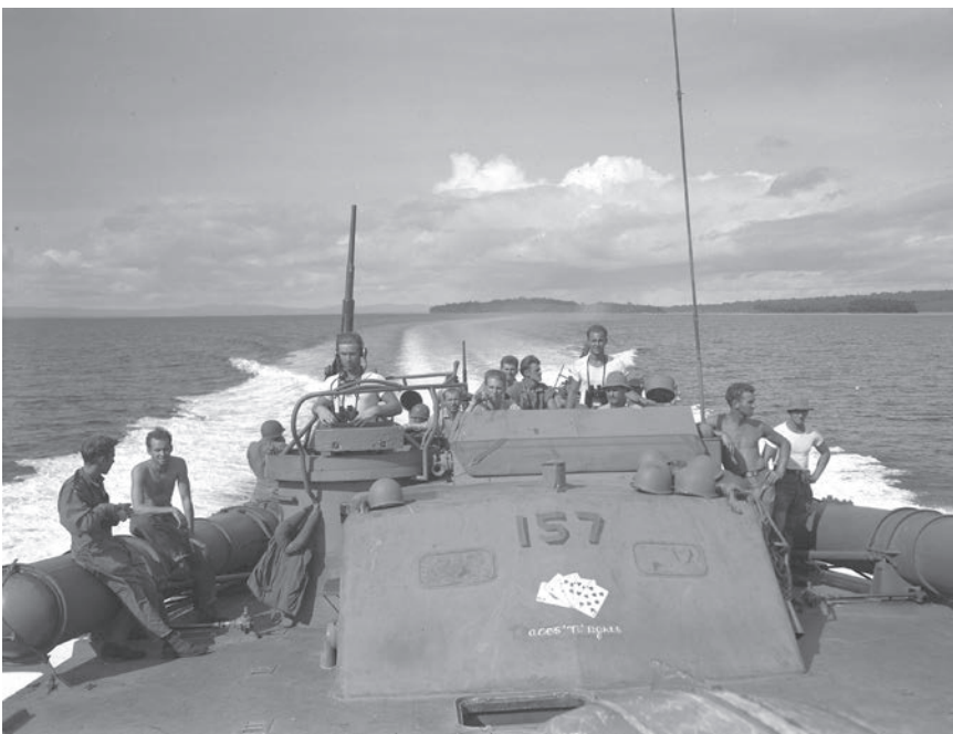
PT-157 and crew...