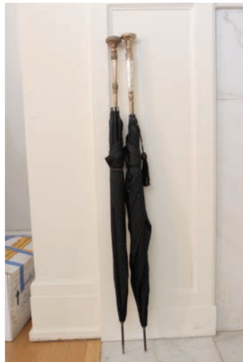
Knapp pearl handled umbrellas